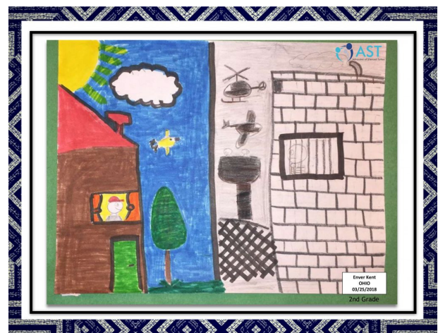
2nd place- Enver, OH (2nd grade)